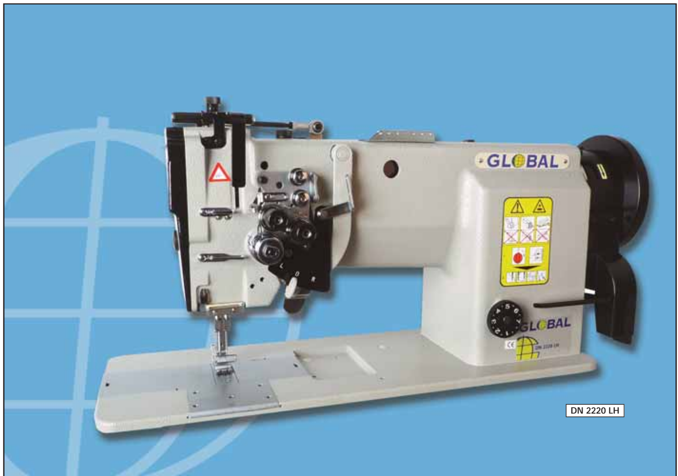
DN 2220 LH