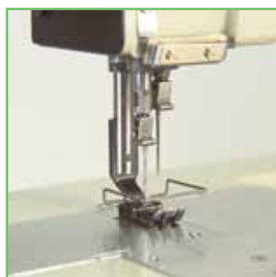
Disengageable needle bars.