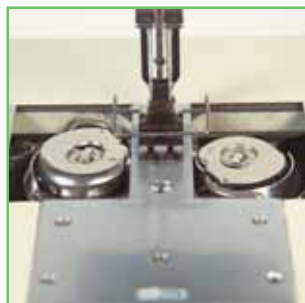
Hooks with bobbin caps.