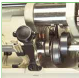
Unique oil pump system